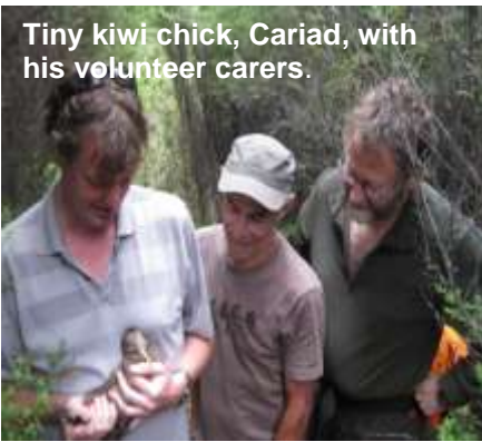
Tiny kiwi chick, Cariad, with his volunteer carers.